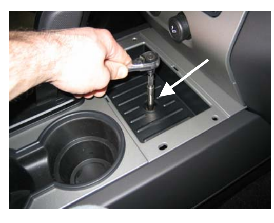
Remove hex head screw from accessory pocket